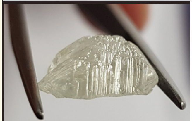
Photographs of diamonds recovered from dredging activities in EL 15/2012