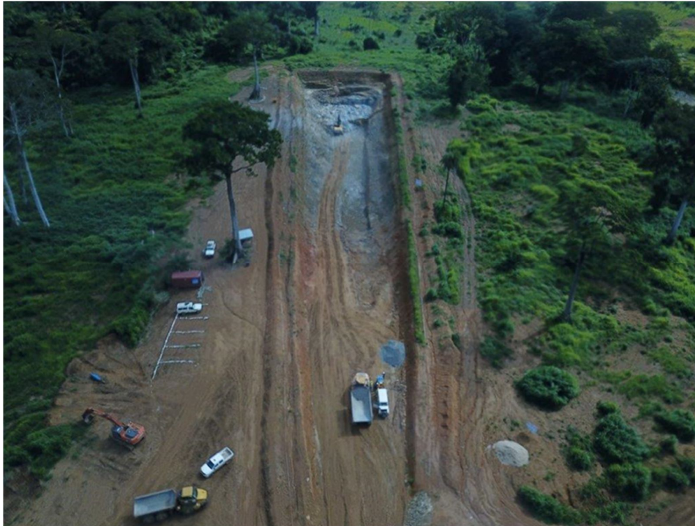
Figure 4: Aerial view of Tongo box cut