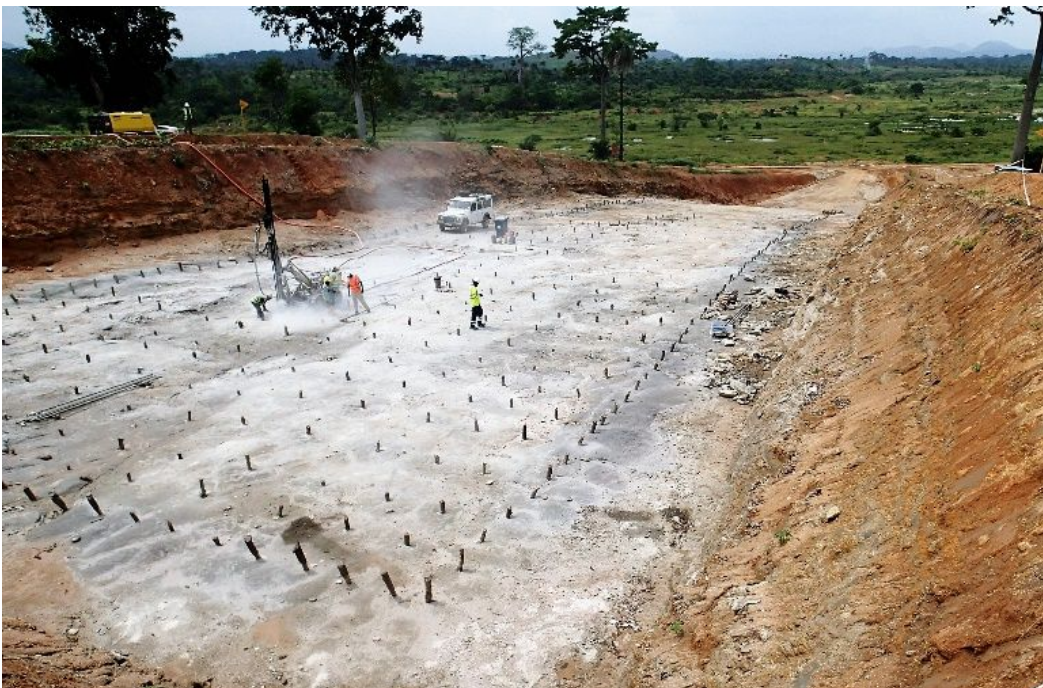
Figure 3: Tongo box cut activity – bench 1 drill pattern