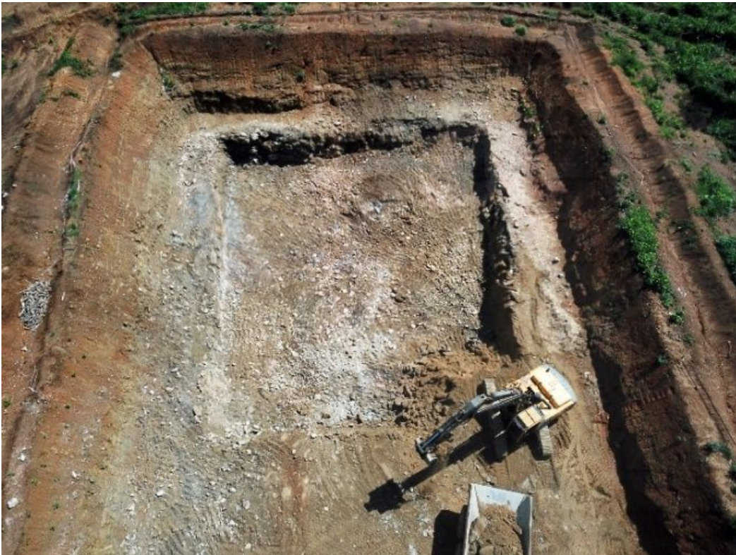
Figure 2: Tongo box cut activity – cleaning blast