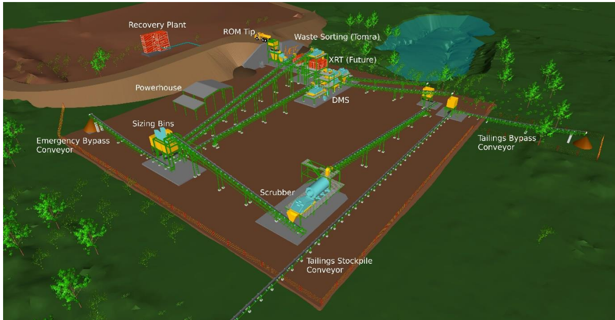
Figure 3: 100tph Plant Design

modifications to the haul road. The final recovery building design was completed, and final tenders will be considered in Q1-20. The three Deotech X-Ray machines for the final recovery were purchased and are currently being shipped to site.